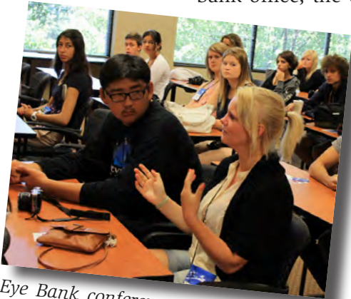
Eye Bank conference center in use for Lions Youth Exchange tour.

If you are investigating metro area locations for a Lions meeting or special activity, the Minnesota Lions Eye Bank Conference Center may suit your needs. Minnesota Lions members may use the room free of charge for Lions functions. For more information, contact Lion Grecia Glass at glass038@umn.edu or 1-866-887-4448.